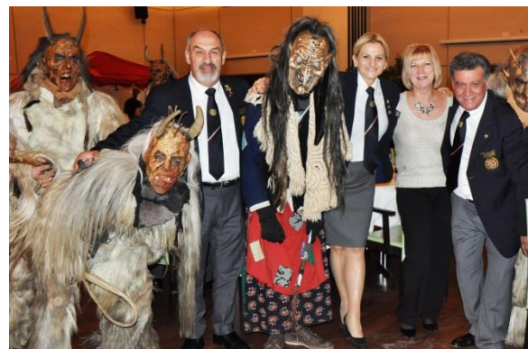
Members of IPA Italy and a Krampus Group

Foreign IPA delegations came from as far afield as Traunstein in Germany, Codroipo, Cortina and Tarvis in Italy and Kranska Gora in Slovenia. The largest group was the delegation of IPA friends from Calw, who had travelled from Germany by bus.